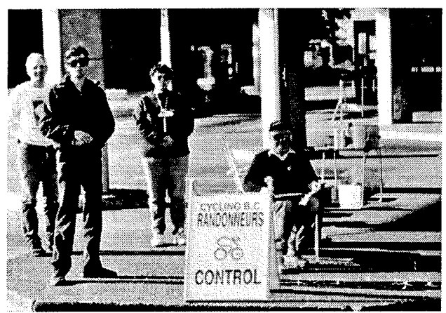
Is Rando Control in your future?